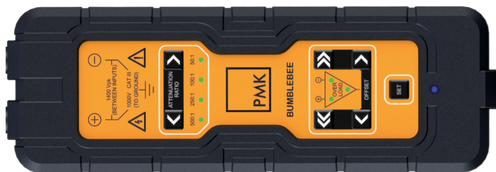
Keyboard Layout - BumbleBee®

Note: All BumbleBee® Models need a Power Supply to function. PMK recommends either a PS-02 or PS-03 Power Supply to ensure highest performance of BumbleBee® as well as other PMK active probes. There is no Power Supply included in the standard scope of delivery. See 889-09V-PS2 and 889-09V-PS3 for more information on PMK Power Supplies available at http://www.pmk.de/en/products/ps02